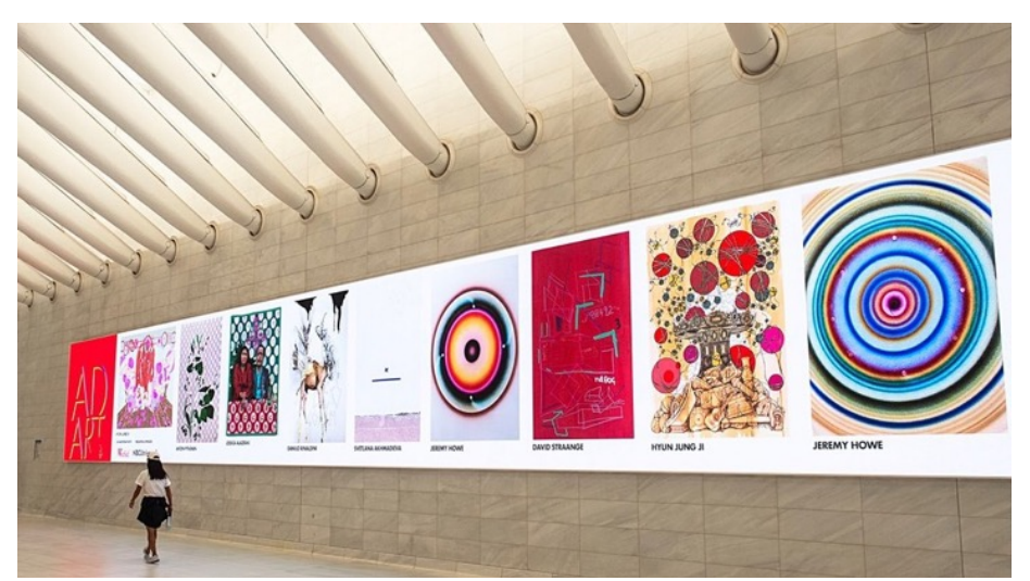
MvVO ART AD ART SHOW at the Oculus at Westfield World Trade Center

York's famous arts institutions are reopening with limited capacity and timed ticketing, AD ART SHOW at the Oculus at Westfield World Trade Center offers art lovers a spacious and FREE art destination, with shops and dining open Mon – Sat, 11am – 7pm, and Sunday, 12am – 6pm. During the month of May, visitors of AD ART SHOW are offered a free sweet and a coffee from show partner, Eataly (located on the third floor).