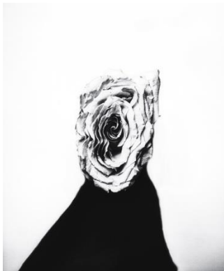
Takamitsu Sakamoto, “An Enduring Afterglow” from “Flower” Exhibition

IG: @lawlormedia | F: LawlorMediaGroup | X / T: @LawlorMedia