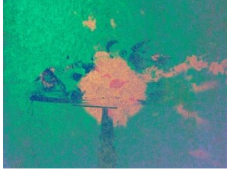
Takamitsu Sakamoto, "Bouquet of Nebulae" from "Flower" Exhibition