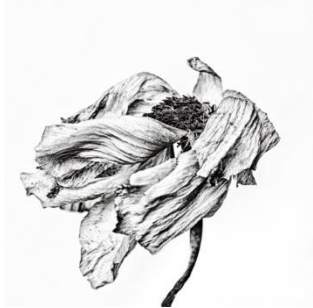
Takamitsu Sakamoto, "The End That Becomes a Beginning" from "Flower" Exhibition