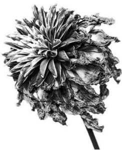
Takamitsu Sakamoto, “The Fractal of the End” from “Flower” Exhibition