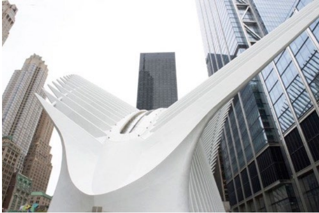
The Oculus at Westfield World Trade Center

AD ART SHOW is a unique experience, bringing ART directly to people by transforming an advertising platform—monumental digital screens—into a public gallery space for an entire month. The artists of AD ART SHOW have a background in advertising/design or related fields. They are following in the footsteps of famous artists like Andy Warhol, Rene Magritte, and Keith Haring. Historically some artists have made the leap, but the barriers persist; and AD ART SHOW throws the doors open for these talented artists with direct connections to the Art world in a celebration of artistic discovery open to all art lovers.